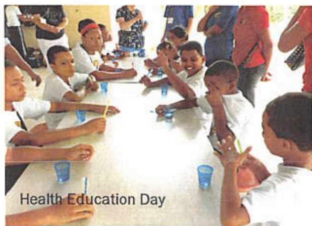
Health Education Day