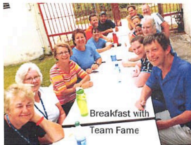
Breakfast with Team Fame